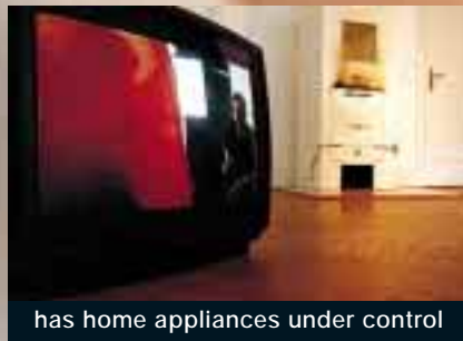
has home appliances under control