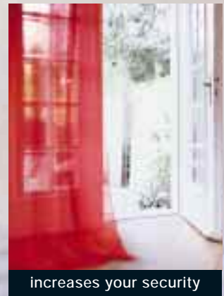
increases your security