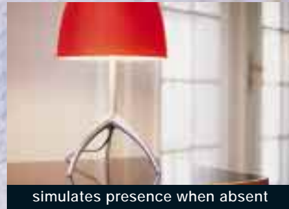
simulates presence when absent