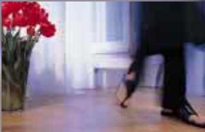
turns on lights