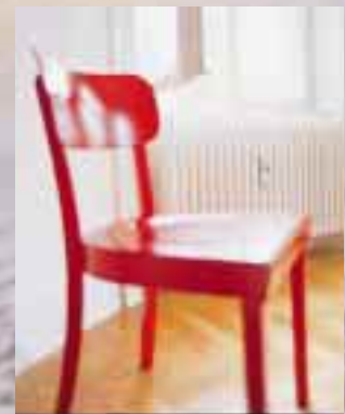
controls room temperature